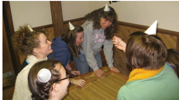
I don't know if it was a goal or not, but it sure was funny :-). ... the girls having a good old "cone-head" kind of fun in the Barakel game room last weekend.