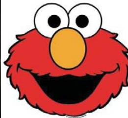
With a little more facial hair dyed red, Gary Edgar might just look a bit like Elmo :-)