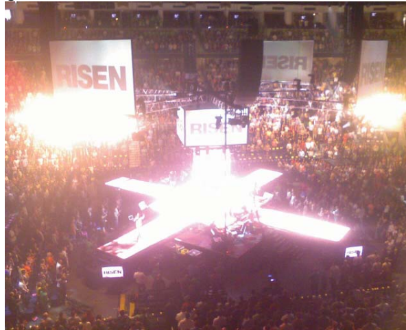
This is a picture from our seats this past Thursday at the Catalyst Conference in Atlanta, GA. The stage was shaped in the form of an 'X' because it is the 10th anniversary of this conference. The theme was "Mark Your Mark" and X is a symbol of a mark. The stage was entirely made from LED lights that could change color and display full motion video. Only us tech geeks can really fully appreciate this ... it was cool!

"It's not really about who is for you or against you. It's about Who you are for." - Andy Stanley at the 2009 Catalyst Conference this past Thursday. Just a warning ... you'll be hearing a number of fantastic thoughts from this conference in the coming weeks. There has been so much to think on here at the Catalyst Conference!