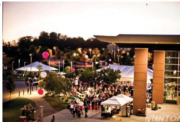
This is a picture of what it looked like at 7:30am this past Thursday. This is Gwennett Arena and the crowd is part of the 13,000 church leaders gathered to be trained and inspired in their leadership. The tent at the bottom center of the picture was serving free coffee and sausage egg and cheese burritos. Yum!