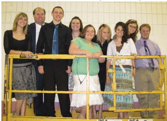
Class of 2008 graduates with the traditional "take a group picture in a strange place after the cake picture in the gym" picture ... is that redundant?

SR HI-Wed. June 3, 7pm-Yth Rm Ah yes ... one of my favorite Wednesday nights of the year ... Senior Night at Real Life this coming Wednesday. This is the night where we encourage our graduating seniors by giving them our words of appreciation, love and kindness. In a way, it's like giving someone a live greeting card but without paper and poems. The seniors will be sitting in the senior chair as they have since the class of 1992. Make sure you are there at 7pm. We don't want to be leaving here at midnight like last year! :-)