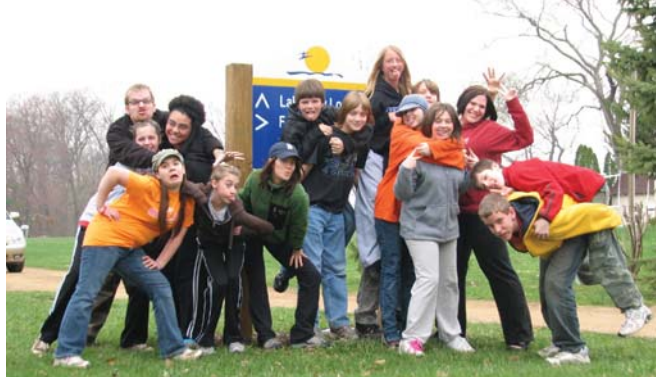
The JR HI group from last weekend's retreat up at Bair Lake Bible Camp striking a silly pose.

To encourage someone literally means to place courage within that person. We're going to do that for each other this next week. Why? Well, first of all, we need it from each other. Secondly, God created us with a special dignity, and one way we acknowledge this dignity is by supporting and loving his creation ... namely each other. God has something for you and your friends who may not know Christ. But you have to be willing to put yourself and encourage your friends to be in the right place to experience it ... to receive it ... and then to learn to live it out. Be there at 7pm. See you then!