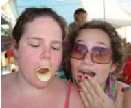
The two birthday girls having some fun with a few Pringles at Ichthus a couple of years ago.