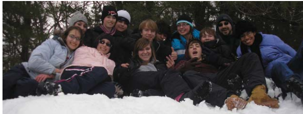
Most of the 2009 SR HI Barakel Winter Retreat group on the crest of a hill near the broom hockey rink.

It's winter break week here at Fellowship and so we won't be meeting this next Wednesday. However, many of you are involved in Youth Sunday, so we'll be seeing a lot of each other this week as we get ready for this annual event. We'll pick up where we left off on Feb. 25. Plan on being there!