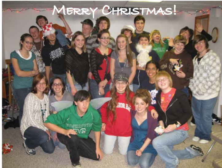
The 2008 SR HI Christmas Party was a smashing success ... with a lot of laughter and funny gifts exchanged. Merry Christmas to each and every one of you!