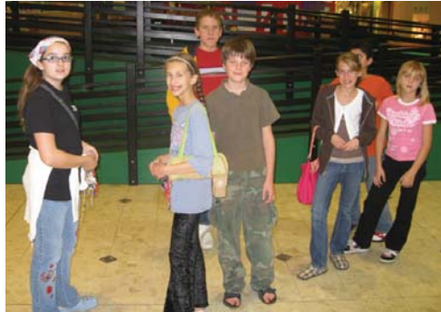
A collection of JR HI students at Oakland Mall last week on their first JR HI Quest Adventure ... a series of Wednesday nights that are off site with a purpose.

My wife can make perfect chocolate chip cookies. I'm sure a few of you got a perfect grade on a test recently. The weather last Sunday was perfect for many of us. So when God commands us to be perfect as He is perfect, how does that work? We all know we can't be perfect. We all know we aren't perfect. But does that mean we don't try and just give up? Absolutely not! There is a perfection available to all of us in this life. Come this Wednesday and discover what that might be. Make the commitment to being there each and every Wednesday night. If you work, get that night off! And bring a friend to share some of these good times with. If you don't bring one, one will be provided for you :-). PS - There will be a Youth Sunday brainstorming/planning meeting open to anyone who is interested at 6pm. Come with ideas for an overall theme.