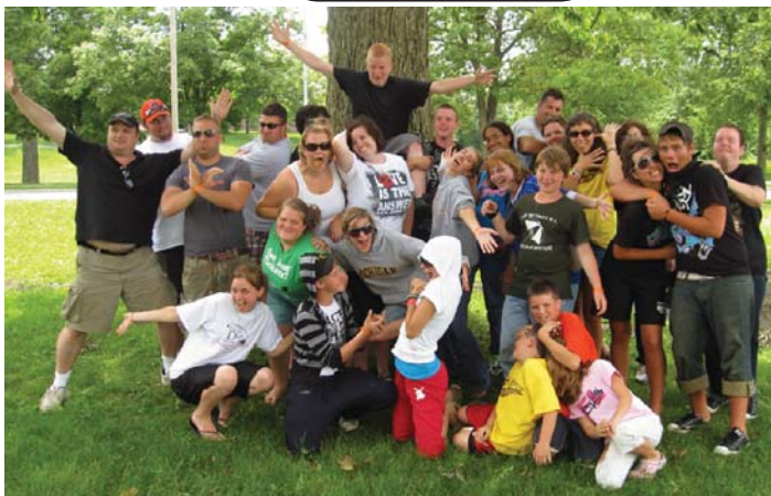
Here's the 30 of us who travelled to Ichthus 2008 in our crazy "after sharing time" group picture.