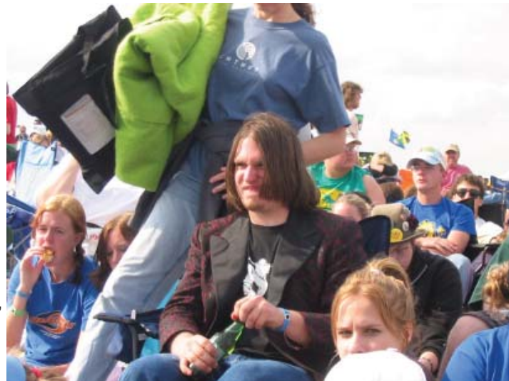
Ok, name each person in this picture that was with our group in Ichthus 2005 ... The two on the left are two girls from Bethany Baptist that came with us that year. The 2 people are partially pictured but probably have enough to guess on. And the main focus of the picture should be the easy one.

Information flyers are available in the lobby or online at our web site ( www.fellowshipchapel.net ). If you still want to go, there may be chance to get you a ticket (if they haven't sold out, but it will cost you a total of $135 to go. See Mike if you have any questions on this issue.