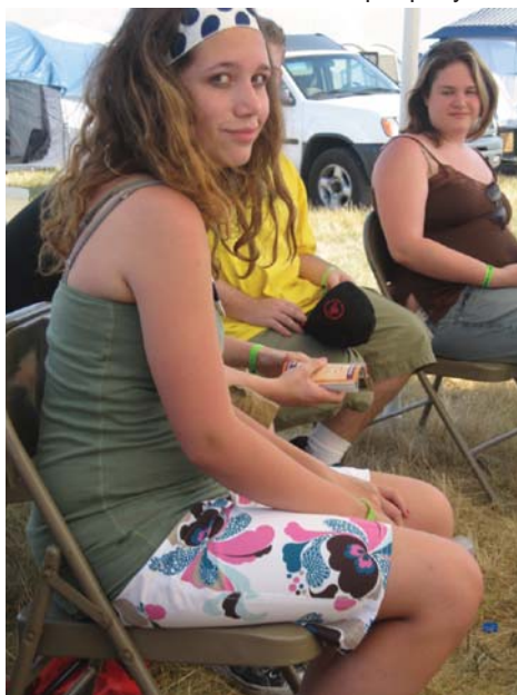
Wow ... check that out. Our two 4/20 birthday girls in the same photo without having to Photoshop it in! How cool is that! These two were sitting under the Great White Whale at last year's Ichthus enjoying the cool shade on a hot summer day.