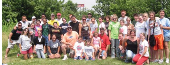
From top to bottom ... the after Ichthus group shots. 2003, 2004 (Mudthus), 2005 (Snowthus), 2006