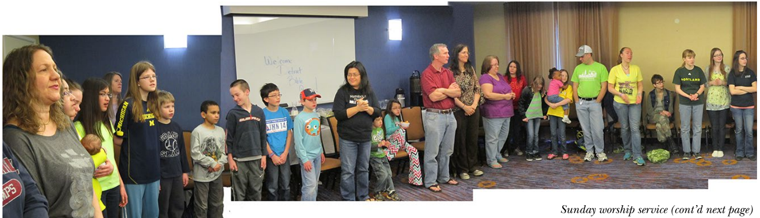
Sunday worship service (cont'd next page)