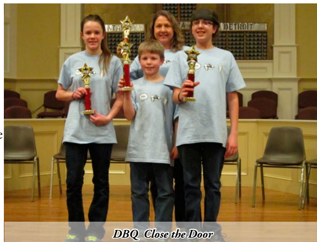
DBQ Close the Door