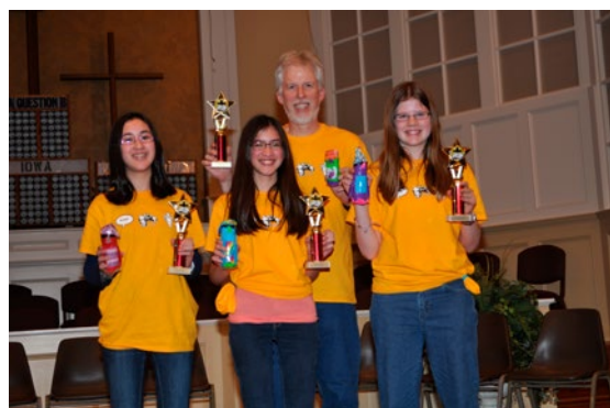
left: DBQ Cockadoodledoo