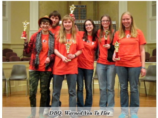
DBQ Warned You To Flee

With just the last question to go and the score 100-120-90, it was still anyone's quiz since DBQ could tie for first with a third-person bonus. Bethel got the jump on question 20, but came up short on the answer. On the toss-up, DBQ got the jump for a chance to tie but also missed the answer. Iowa closed out the quiz with a freebie to claim its victory.