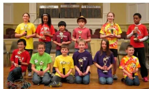
below right: DBQ Little League teams take fourth and fifth place