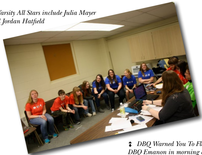
⚡ DBQ Warned You To Flee and DBQ Emanon in morning action