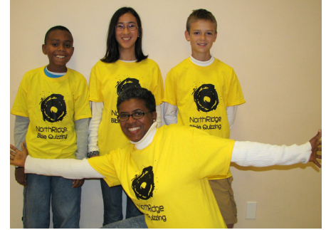
NC Peter, Andrew & Mary