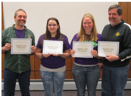
Daddies' Little Princesses

After a closely fought playoffs, the top three teams quizzed in order into the Finals, though the Susquehanna Valley Bible Quiz League team had a terrific playoff run to come from last place and almost make it to the Finals.