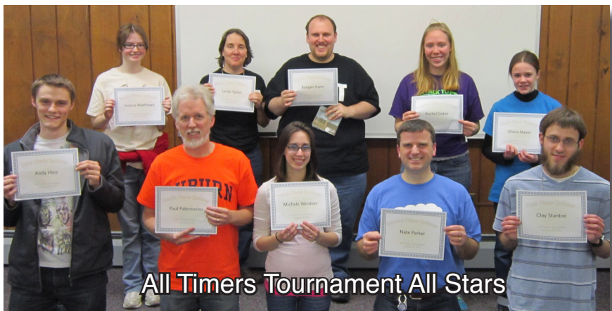
All Timers Tournament All Stars