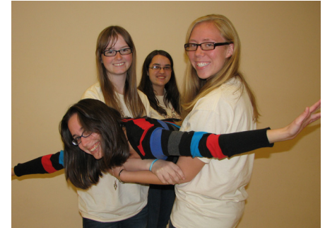
♥ Look at the Bluebirds