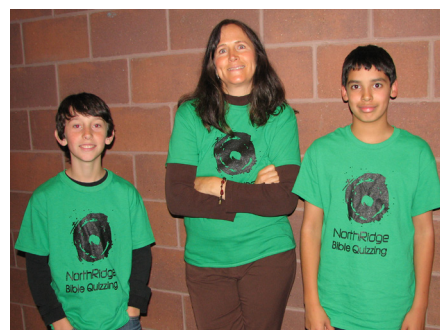
NC Pour in Spirit