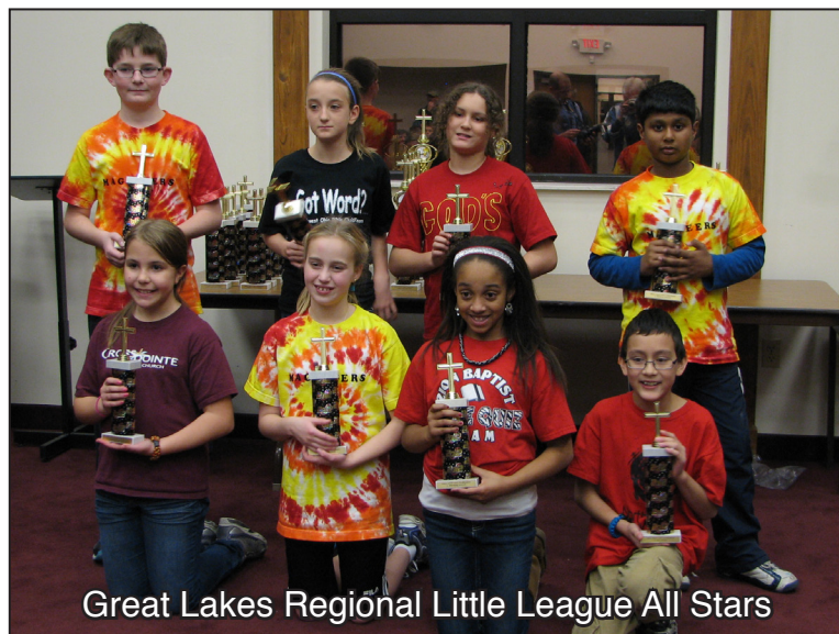
Great Lakes Regional Little League All Stars