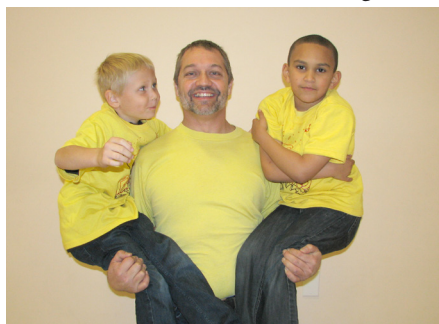
Fire & Flames