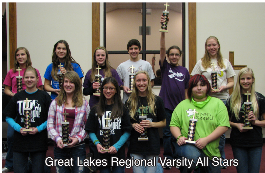
Great Lakes Regional Varsity All Stars