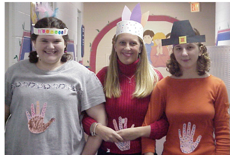
from the archives: a fun thematic approach to uniforms

Team Names. Please identify the sponsoring church or organization (initials are OK) while limiting the overall length to 24 characters and spaces.